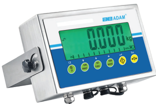
AE 403 Indicator