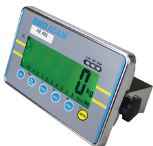
AE 402 Indicator